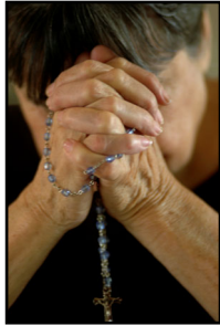
Many Hispanic Americans believe that stress plays a factor in the development of dementia.