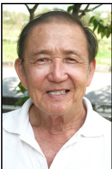
Traditionally, Chinese people with dementia are cared for by the oldest son and his wife.